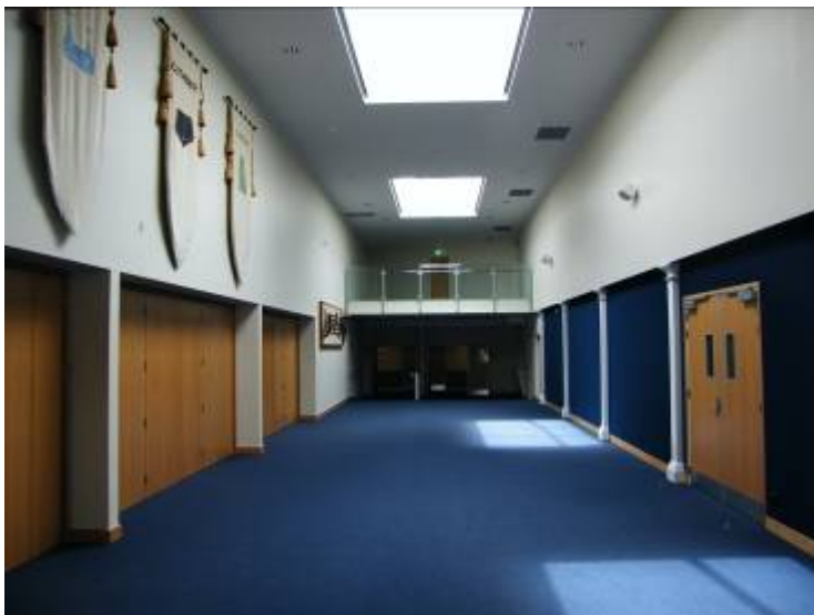
The Atrium in the entrance to the Performing Arts Centre