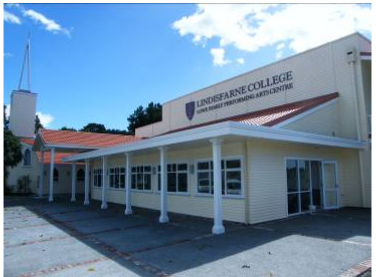
The Oral Communication classroom at the front of the Low Family Performing Arts Centre