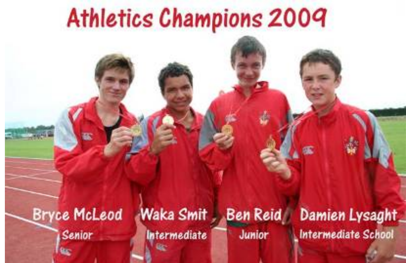
Champions in their division