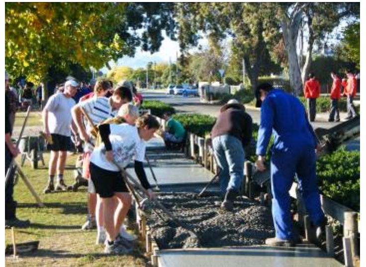
Open Day - The Rector addresses parents and students in the Auditorium and Fathers' and Sons' laying the pathway