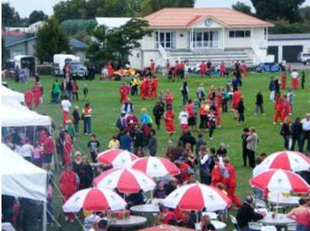
Lindisfarne College Gala in action