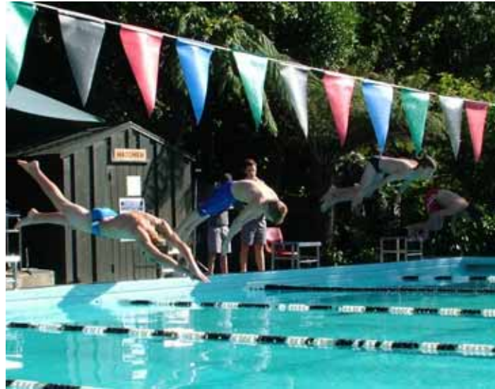
Swimming Sports Competitors