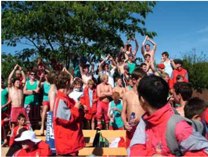
Durham House show great spirit at the Swimming Sports