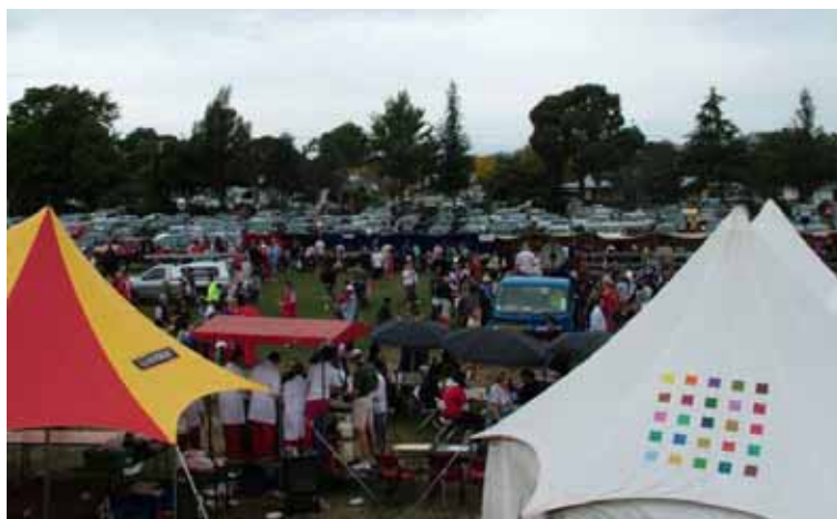
An overview of our very successful gala. 10SEY hamburger stall in operation.