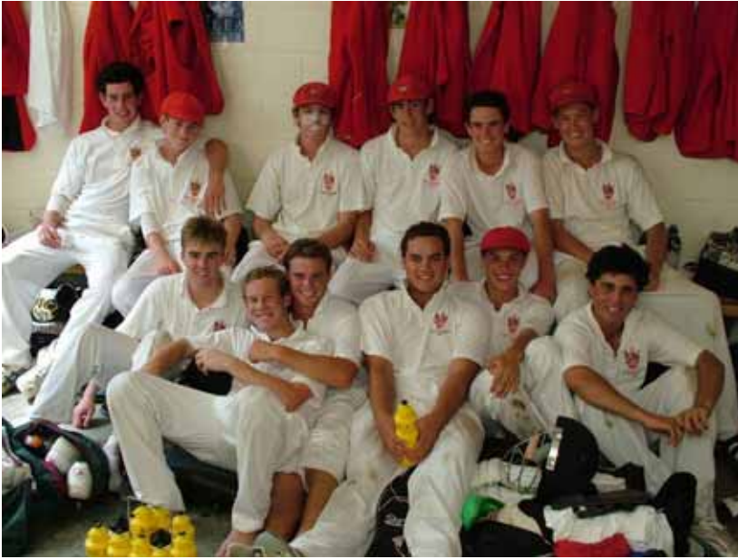
The highly successful 1 st XI after the St Pauls Collegiate match