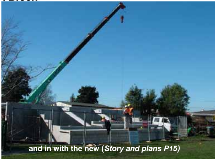
and in with the new (Story and plans P15)