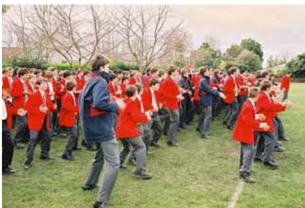
Left The school lending physical and vocal support to our teams