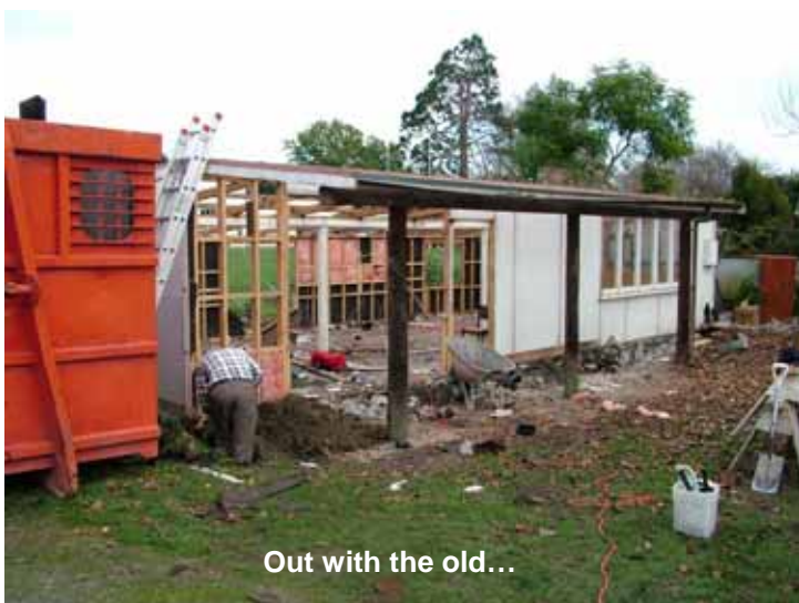
Out with the old...