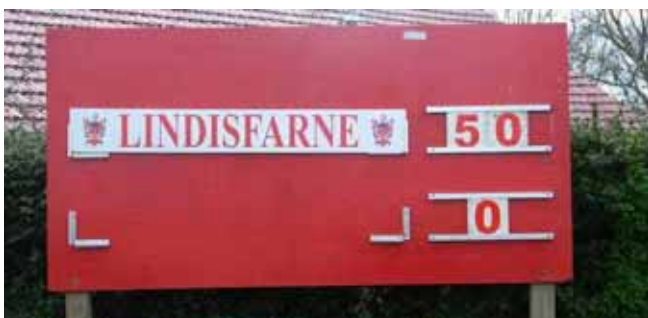
The Scoreboard tells the story