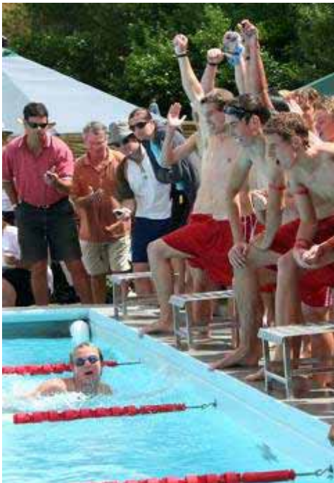
Swimming Sports Relay