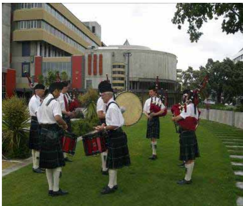
The pipe band warming up for the event