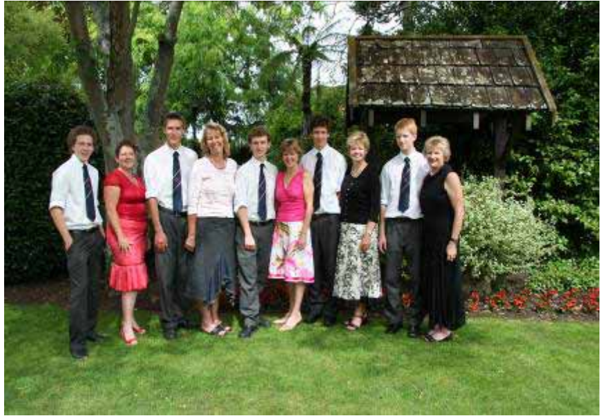
Resplendent in the leavers ties- Seventh formers from 2007 with their mothers