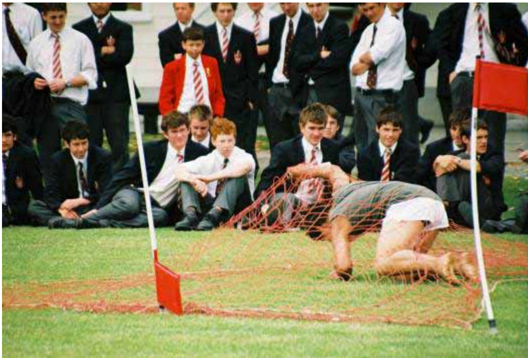
Action from the final Inter-House Activities - The Park Relay