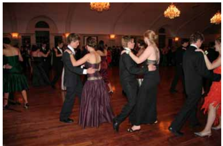
Boys and their partners enjoying the waltz at the Ball

With Lindisfarne located in a provincial centre, servicing a largely rural community, we do not reflect the global or in fact the economic or demographic influences of New Zealand cities such as Auckland or Wellington. As adults, many of us have chosen to live in the Hawke's Bay for the lifestyle, climate, and sense of community that exists within our region. Many of you have sent your son to Lindisfarne for the traditional values we try to instil in our boys, as well as for the exposure to the possibilities and potential opportunities that exist.