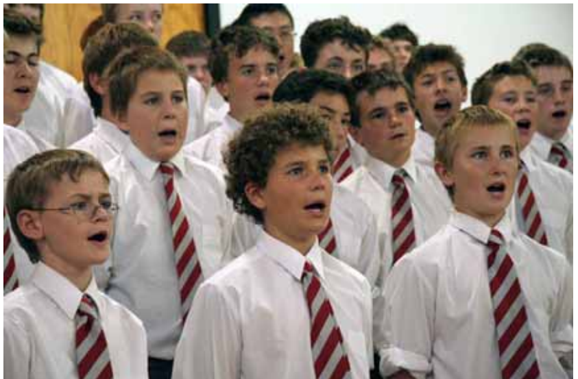
Durham House in the House Choir