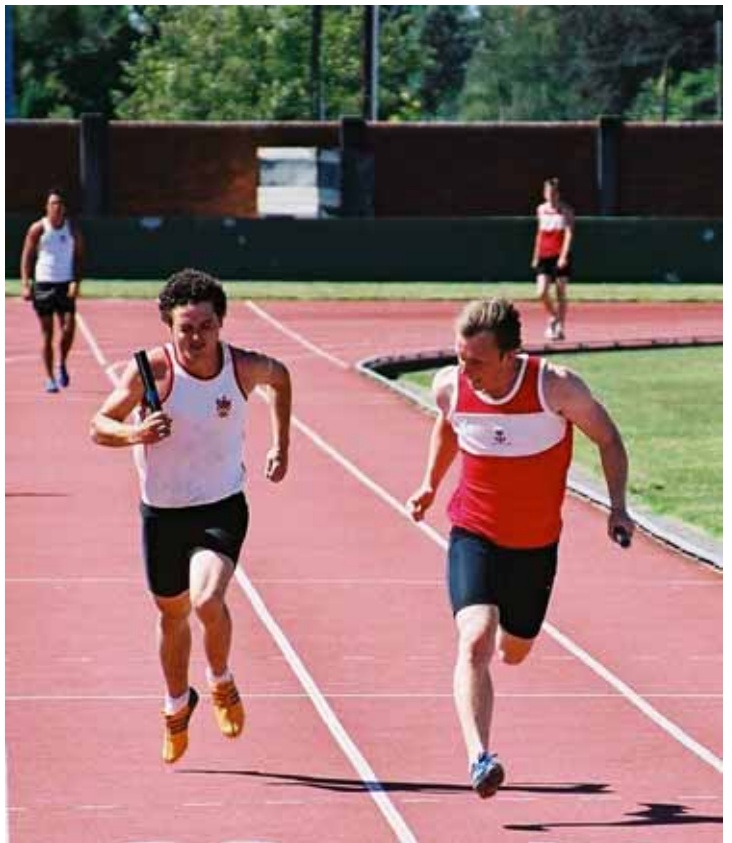
A battle to the end in the Athletics relay